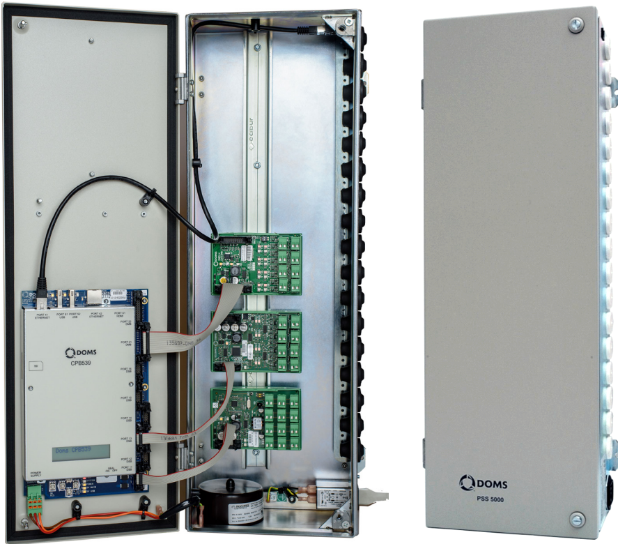
PSS 5000 unit opened (to the left) and closed (to the right). The CPU board and hardware interface modules are mounted inside the controller box, where the POS and forecourt equipment are connected.